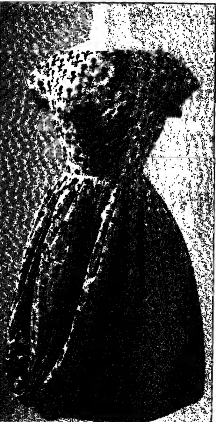
Clockwise from top left: White taffeta evening gown by Christian Dior; 19th century-inspired dress by Pauline Trigere; classic black taffeta evening gown by Dior; black and white floral dress from the '50s by an unknown Italian designer.

Of late there has been so much shloeb masquerading as fashion that it's sheer joy to look at garments which are more than just clothes.